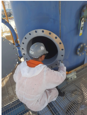
Coating application in progress to the manway and flange