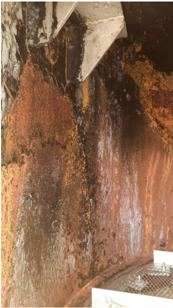
Traces of severe corrosion from under the rubber lining

The rubber lining of the CO2 absorber was swelling, blistering and crackings throughout the tank interior. Corrosion damage to the base metal was so pronounced that it could be glimpsed through cracked/delaminated rubber lining.