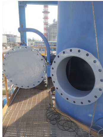
Manway and flange coated and protected