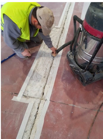
Cleaning after the preparation to remove dust and small debris