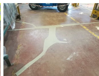
Complete repair on a warehouse floor