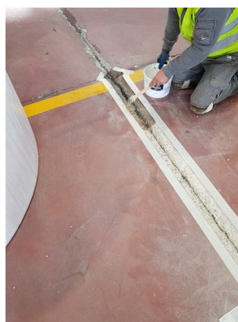
Belzona 4911 Conditioner applied to the exposed concrete substrate in the repaired area