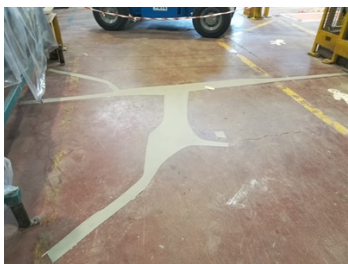
Complete repair on a warehouse floor