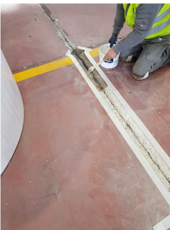
Belzona 4911 Conditioner applied to the exposed concrete substrate in the repaired area