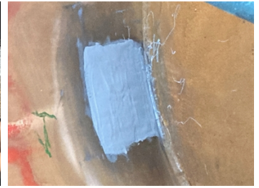
Hole after the application