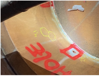
Big pitting with hole

The Jet fuel tank had 14 points with pitting . The refinery wanted to fill up the tank with Jet fuel ASAP .