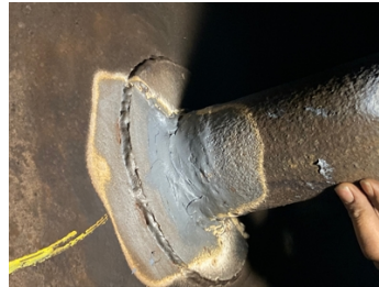
After the application of Belzona 1161