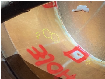
Big pitting with hole

The Jet fuel tank had 14 points with pitting . The refinery wanted to fill up the tank with Jet fuel ASAP .