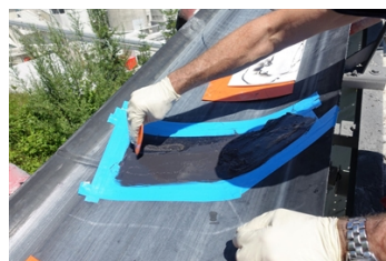
Application in progress