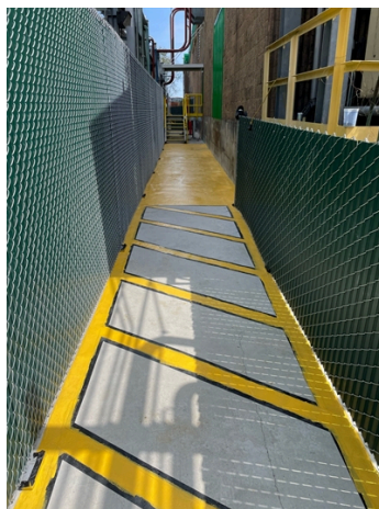
Belzona 5231 applied to half of the high traffic area