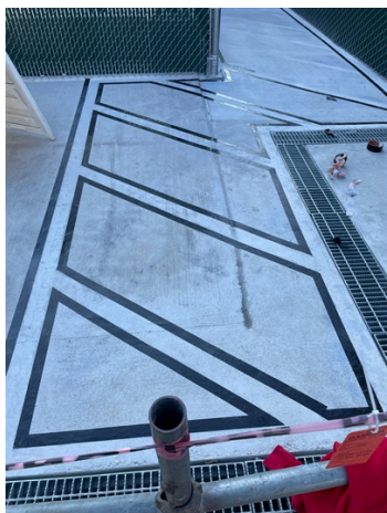
Pre Job inspection

This high traffic area in this lube oil facility was in need of a nonskid safety grip system due to the potential slip and fall hazard the area presented.