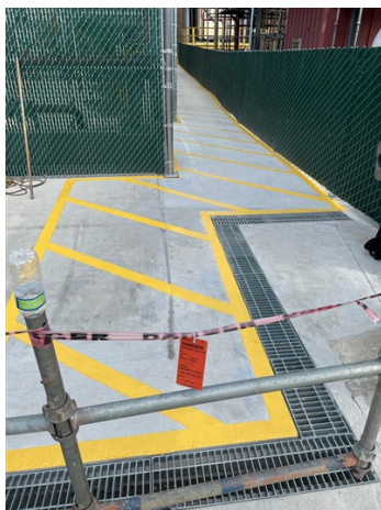
Application in progress