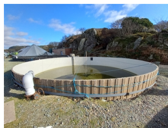
Completed application &amp; filling in progress