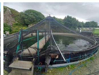
Application in service 12 months