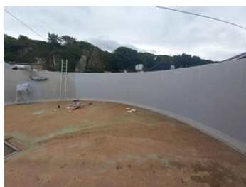
Belzona 5811DW2 application in progress