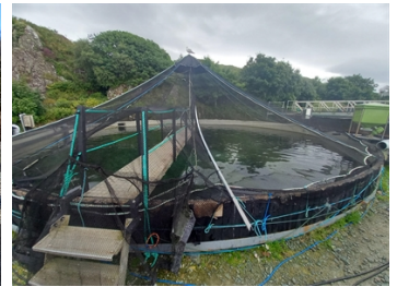
Application in service 12 months