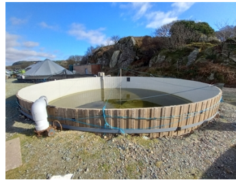
Completed application &amp; filling in progress