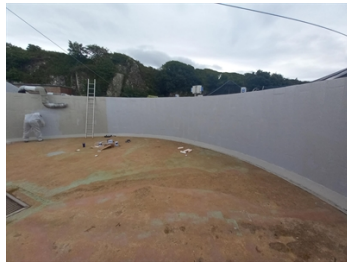
Belzona 5811DW2 application in progress