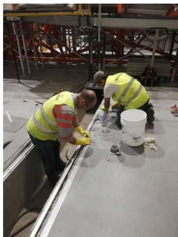
Applying Belzona 4111 (Magma-Quartz)