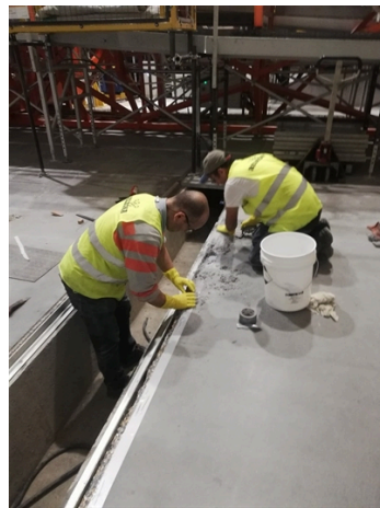
Applying Belzona 4111 (Magma-Quartz)