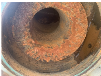
Close up of pitting BEFORE

Drainage issues inside facility was causing backups. While dredging canals client took opportunity to improve pump for efficiency.