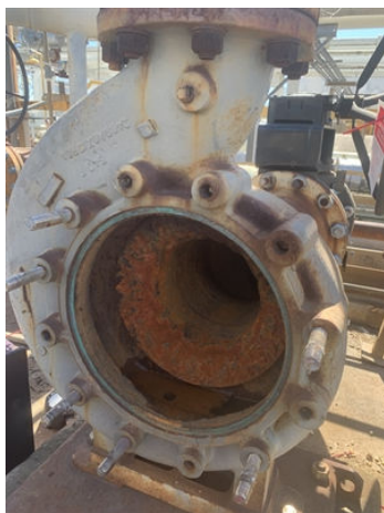
Pump in place prior to improvements