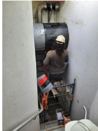
1st layer of Belzona SWII