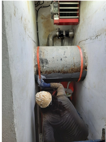
Plate bonding over the most critical area