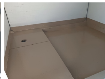
Preparation work completed