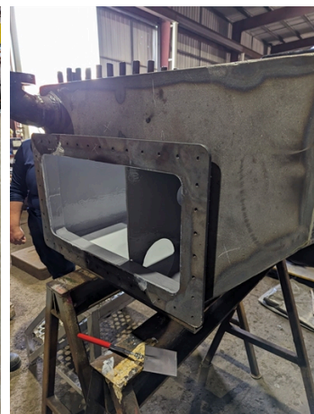
After application of Belzona 5892.