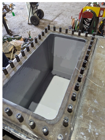
After application of Belzona 5892.