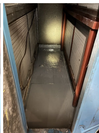
Second coat of Belzona 5831LT Grey applied.