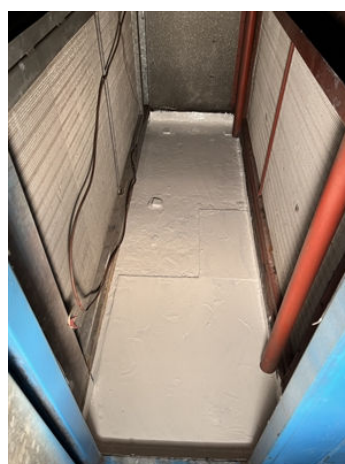
First coat of Belzona 5831LT White applied.