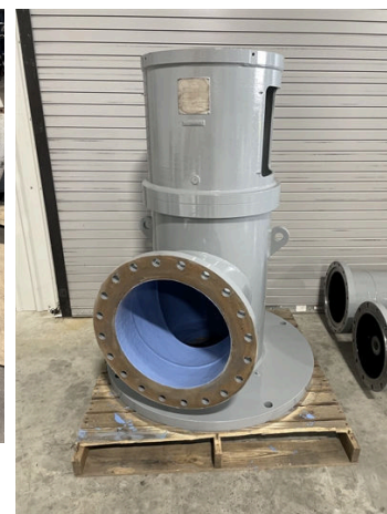
Head After Belzona 5811/5111 External/ 1341 Internal