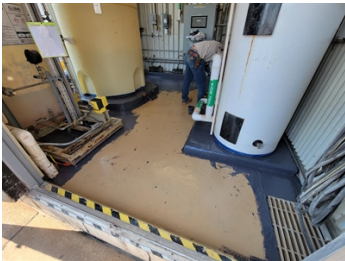
Beginning of the application

The customer did not really have a problem with the concrete but decided to protect the containment area avoiding futures damages of chemical attack.