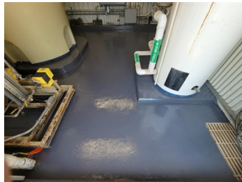
Application of first coat of Belzona 4311 gray