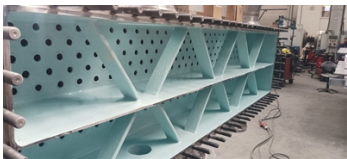
OEM Heat Exchanger Lining