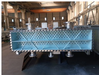
OEM Heat Exchanger Lining

The customer required a lining for their newly fabricated heat exchangers to prevent corrosion, increase temperature resistance, and prolong the equipment's lifespan.