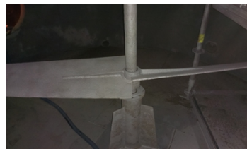
Tank after blasting.