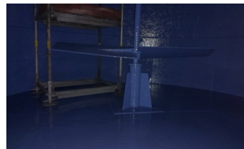
Application of the first coat of Belzona 1341.