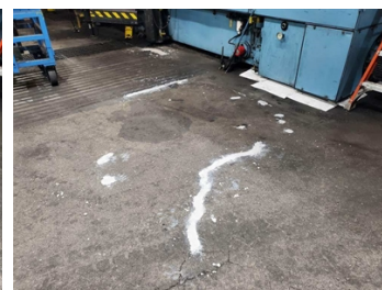
Several damaged areas repaired.