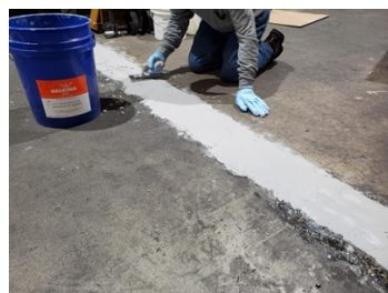
Damaged doorway area repaired.