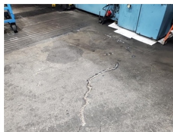
Showing several areas of damage near a machine.