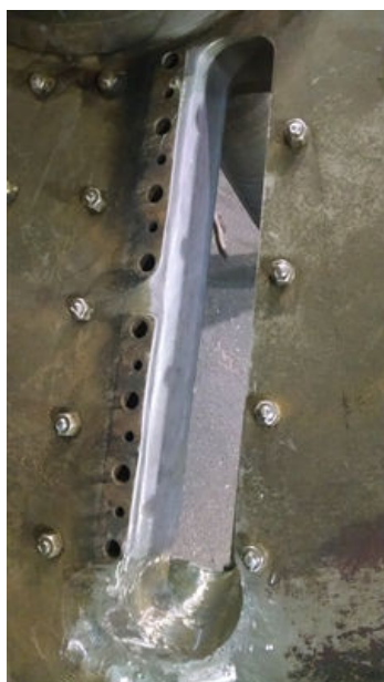
One of the pockets ready for application.