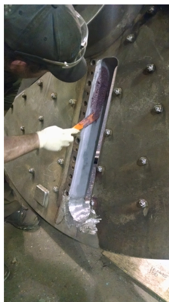
Starting the application.