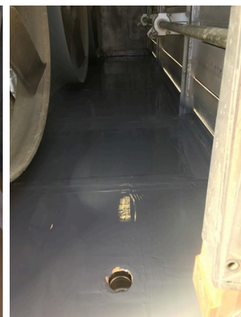
The cooling tower.