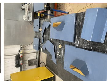
Showing the plates following the application of 2 x colours of Belzona 1321 Ceramic S Metal