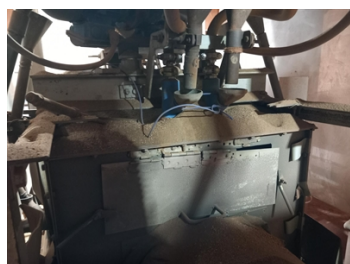
External of the blast enclosure in situ

The steel wall plates of the blast enclosure were naturally wearing away by the internal blasting process. This would lead to through-wall and escaping blast media and dust. Eventually the line would have to be stopped and the plates replaced, causing downtime and manpower resource requirements. There was also a cost issue with continually buying new parts