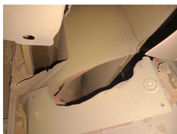
Internal view showing the totally worn away side plates where debris, dust and blast media can escape