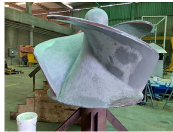
Application of Belzona 1121 (Super XL-Metal)