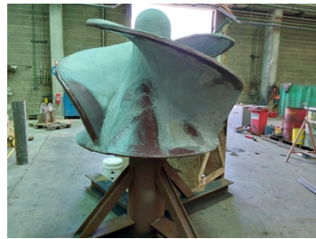
Application of Belzona 1811 (Ceramic Carbide)