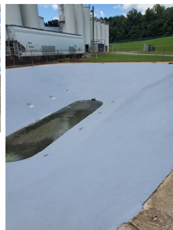
Containment area finished with two coats of Belzona 5231