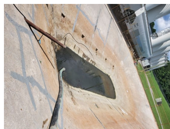
Cracks being repaired with Belzona 3121