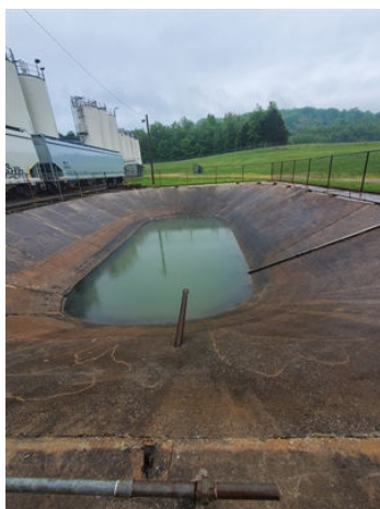
Containment area before restoration.

The containment area was very old and was suffering issues with cracking. The containment area was not in use but looked really bad for the inspectors of the plant. They wanted to save the area in case they decided to use it.