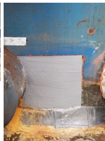
Damage on the tank.