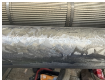
Pipe after surface preparation