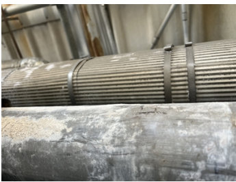
Pipe before surface preparation.

Stainless Steel pipe carrying sewage water with polymer particles was cracked and leaking. Customer was convinced after extensive scrutiny and technical support.