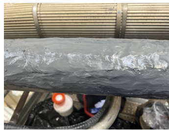
After application of Belzona 1212.