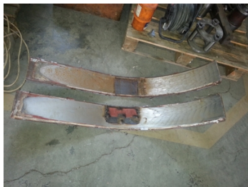
Surfaces prepared before applying Belzona products.

Due to the influence of wood chips, significant abrasion occurred.