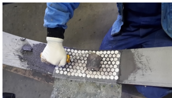
Application of Belzona 1812 and 9811 products.