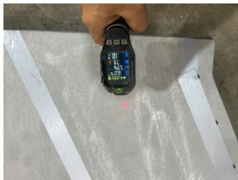
Environmental taken for QC documentation.