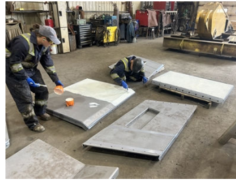
Application in progress