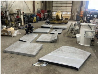
Pieces of chute grit blades in shop

Sticking coal caused downtime and backed up processes.