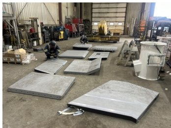
Pieces of chute grit blades in shop

Sticking coal caused downtime and backed up processes.