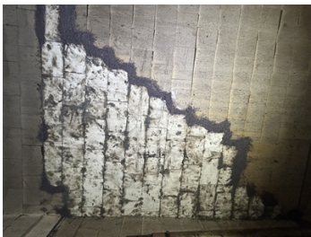
Tiles and grout completed