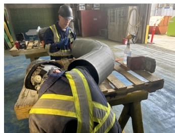
Application in progress