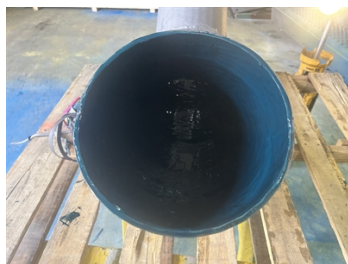
Base coat applied