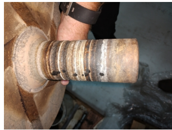
Shaft showing heavy uneven wear.