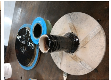
Showing some of the pieces with the application complete.