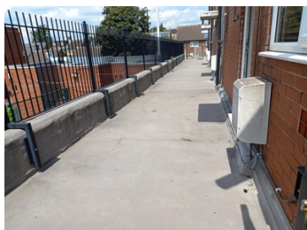
Bitumen Balconies letting in water to structures below

Multiple issues needed to be addressed in this large project where 2 groups of 5 flats had issues with spalling concrete to stairwells, unsafe, broken and slippery concrete stairs, spalling concrete in the stairwells and leaking bitumen on the balconies above. The stairwell brickwork also required sealing