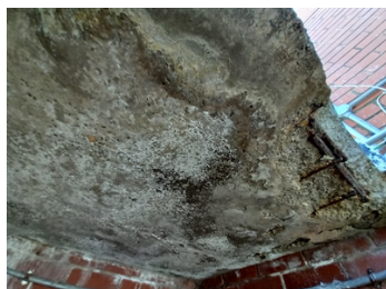
Stairwells showing severe spalling with possibility of falling concrete