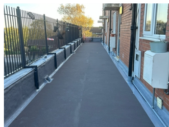
Balconies fully coated with the addition of Belzona Surefoot aggregate