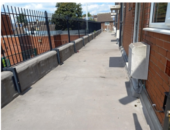
Bitumen Balconies letting in water to structures below

Multiple issues needed to be addressed in this large project where 2 groups of 5 flats had issues with spalling concrete to stairwells, unsafe, broken and slippery concrete stairs, spalling concrete in the stairwells and leaking bitumen on the balconies above. The stairwell brickwork also required sealing