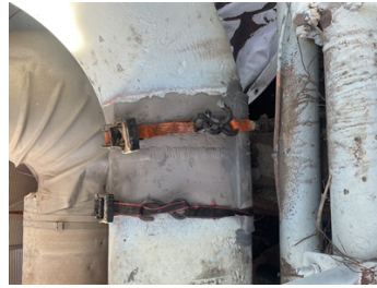
Application of cold bonded plate with Belzona 1161.