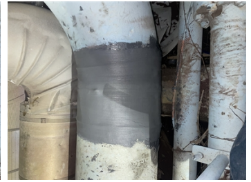
Finished application with Belzona 1212.