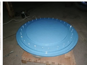
Valve coated with Belzona 1341 (Supermetalgilde)