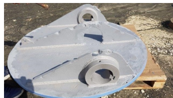
Belzona 1111 (Super Metal) rebuilt the damaged metal surface