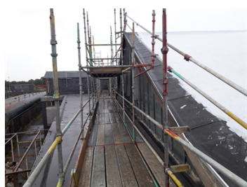
Belzona 3131 application

Two large roofs were experiencing leaks due to ageing mineral felt. This was causing issues to the operations inside the buildings.