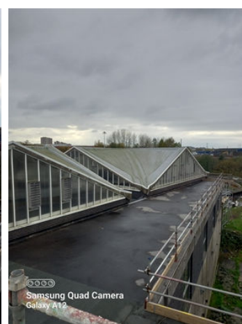
Still in excellent condition