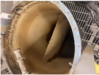
Tank before refurbishment.

Process water lining was experiencing corrosion due to erosion.