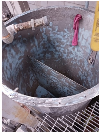
Lining after abrasive blasting.