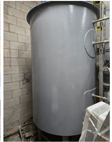
After application of external coating.