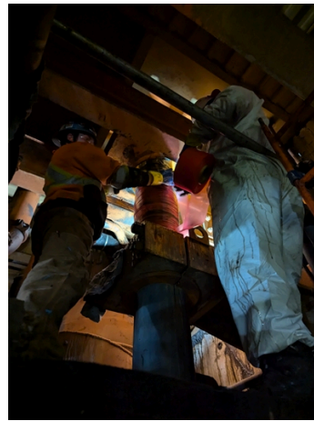
Super Wrap II was installed.