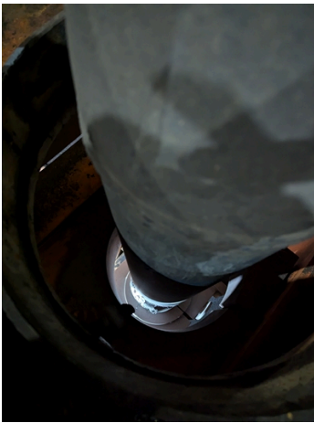
Pipe after surface preparation.

A pipe transporting over 2000 Psi of process water had a leak and a metal plate was welded. However, the pressure of the water would always find a way through the weld seams. Belzona was contacted based on previous successful applications we have been able to achieve on leaking pipes in recent times.