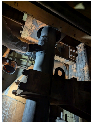
Pipe and metal plate covered with Belzona 1212.