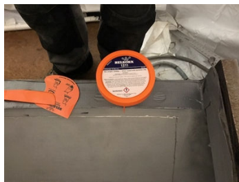
Ready to apply the Belzona 1311.