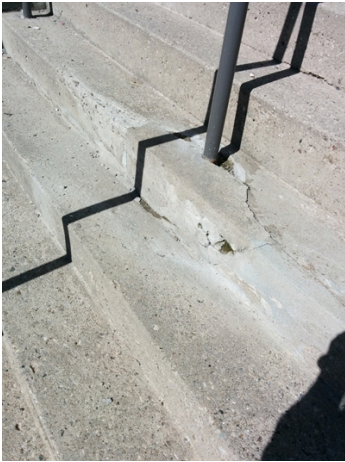
Cracks on stairs before repair.

Stairs was experiencing cracks along the railing pillar and was on the verge of falling apart.