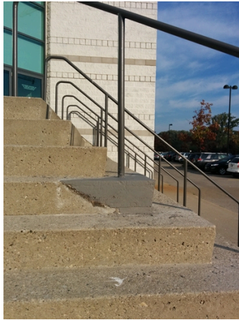
Further cracks .