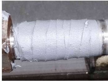
Application of Belzona 1111