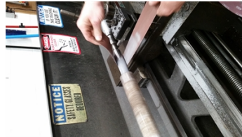
Sanding out for final touch of the repair.