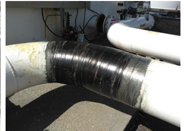
Super Wrap II repair completed