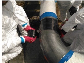
Application of Belzona 9381 Reinforcement Tape