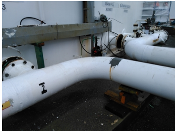
Pipeline to storage tank.

Pipeline to storage tank was suffering from thin wall corrosion at the weld seam.