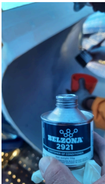
Belzona 2921 Surface Conditioner Application

The bonding of the previously installed neoprene rubber sheet failed. Traces of corrosion dripping out in between the rubber sheet and the clamp were observed after a few months of installation.