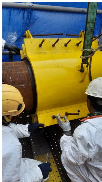
Clamping using a dummy pipe to compress the Neoprene Rubber sheet