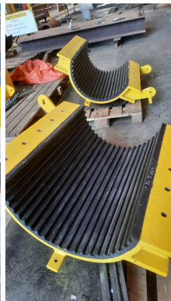
Completed Bonding Application