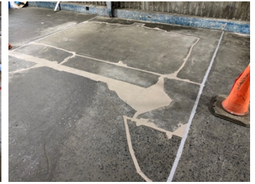
Completed Belzona 4131 areas & Belzona 4521 applied