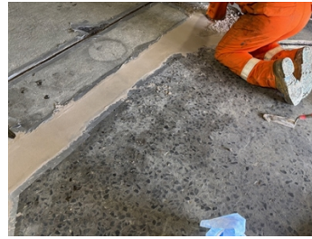
Belzona 4131 application