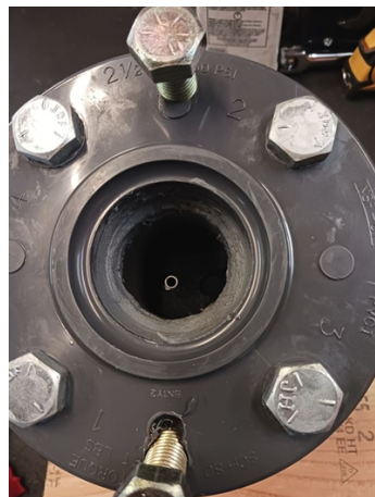
Belzona 1111 placed on flange and former, former bolted to valve body and torqued into place.