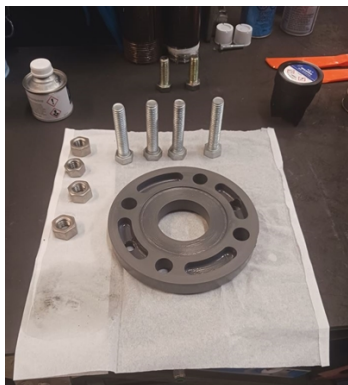
Former ready with Belzona 9411 applied

Valve body flange was experiencing corrosion and metal loss