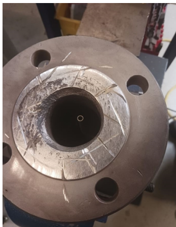
Surface Preparation completed of the flange