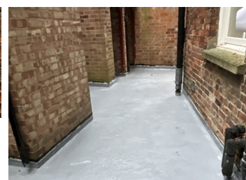
Completed with 2 x coats Belzona 3131