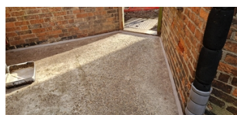
All flaunching completes