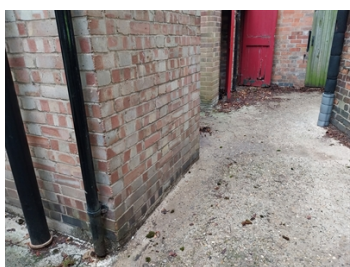
Showing areas of possible leakage through to the underground boiler house

A scope was suggested to flaunch the interfaces between the concrete floor and brickwork areas, followed by 2 coats of Winter Grade Belzona 3131