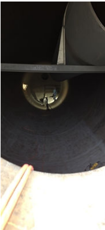
Looking into the Knock out drum for the outside .

The knock out drum had pitting on 55% of the tank. Sherwin Williams Company did not have a pitting filler.