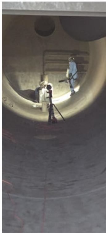
Contractor applying Belzona 1511