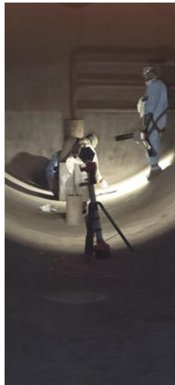
Looking into the Knock out drum for the outside Contractor applying Belzona 1511