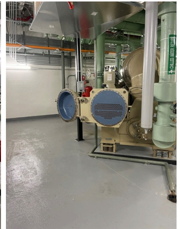
Chiller completed application