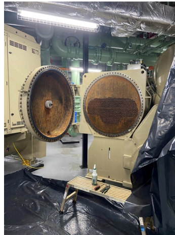
Chiller current condition opposite side