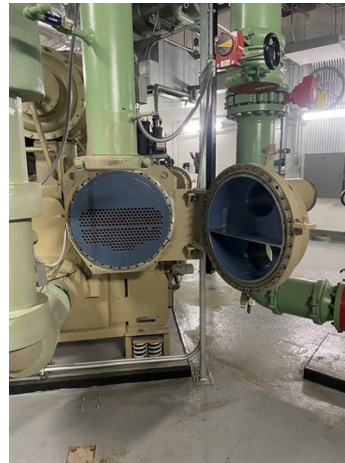
Chiller completed application one side