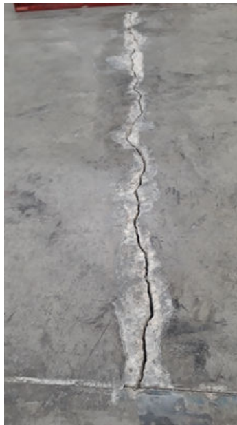
Cracks, showing prep to sides and solid surrounding substrate