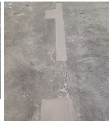
Area 1 fully repaired and checked on some 5 years after, still in place, still performing