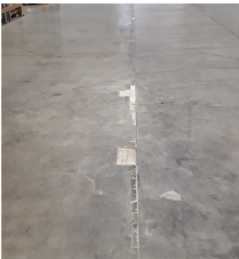
A general area to repair (Area 1)

Various cracks and damage had been identified which caused issues for the hard-wheeled fork lift trucks and hand pallet trucks losing their loads